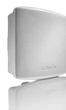
Lighting Receiver RTS The lighting receiver to operate the garage door lighting with RTS controls.

Somfy Ltd Moorfield Road Yeadon Leeds West Yorkshire LS19 7BN T. 0113 391 3030 F. 0113 391 3010 E. sales.uk@somfy.com