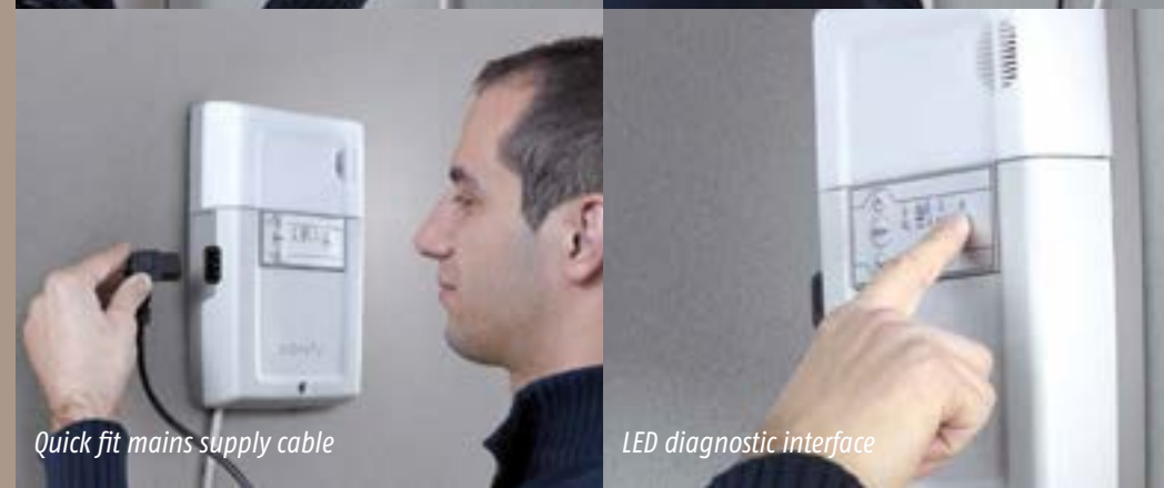
Quick fit mains supply cable